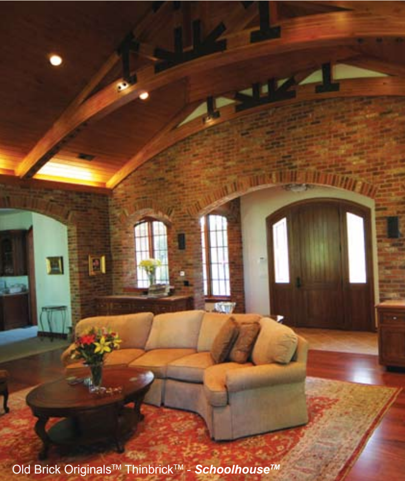
Old Brick Originals TM Thinbrick TM - Schoolhouse TM