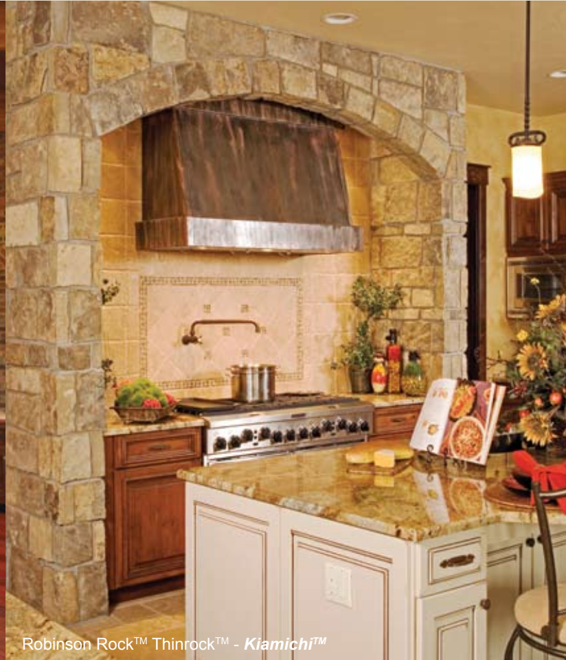
Robinson Rock TM Thinrock TM - Kiamichi TM